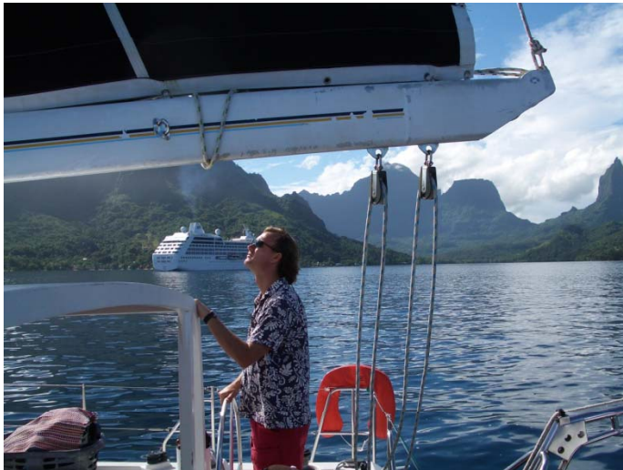
2008 Founders' Retreat Tahiti Cruise